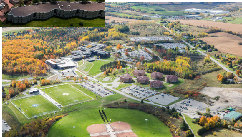
Fleming Campus ▶