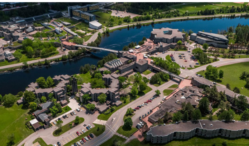
◀ Trent Campus

The Fleming College Career Services team and Trent University CareerSpace can help you explore career options by identifying your skills, values and interests, getting information about the labour market, and researching related college programs. They will also help you with the process of applying for jobs, including critiquing a resume and cover letter and advise you on Networking strategies and Interview preparation.