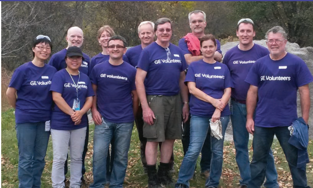
GE employee volunteers participating in GE Day of Caring on Fleming College Trails.

Active philanthropists also have a lower occurrence of depression. When we focus on others’ problems and try to help them, it tends to put our own issues into perspective and helps us to forget about our troubles.