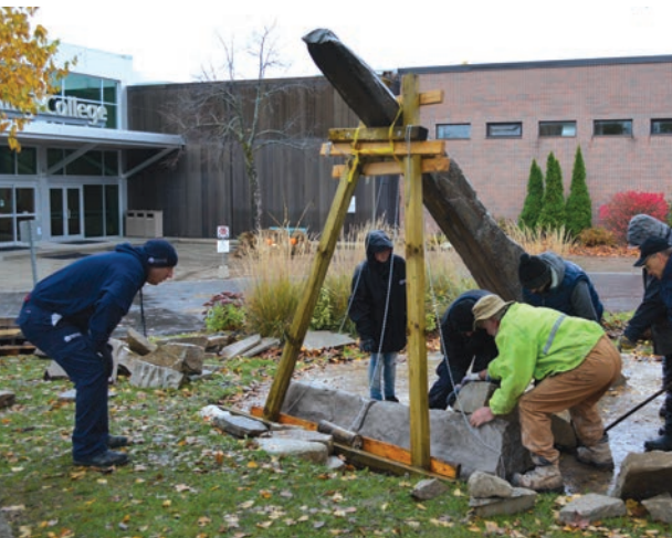
Students from Peterborough, England participate in the stone sculpture construction.

Fleming College has been the recipient of a number of recent in-kind gifts from our generous donors.