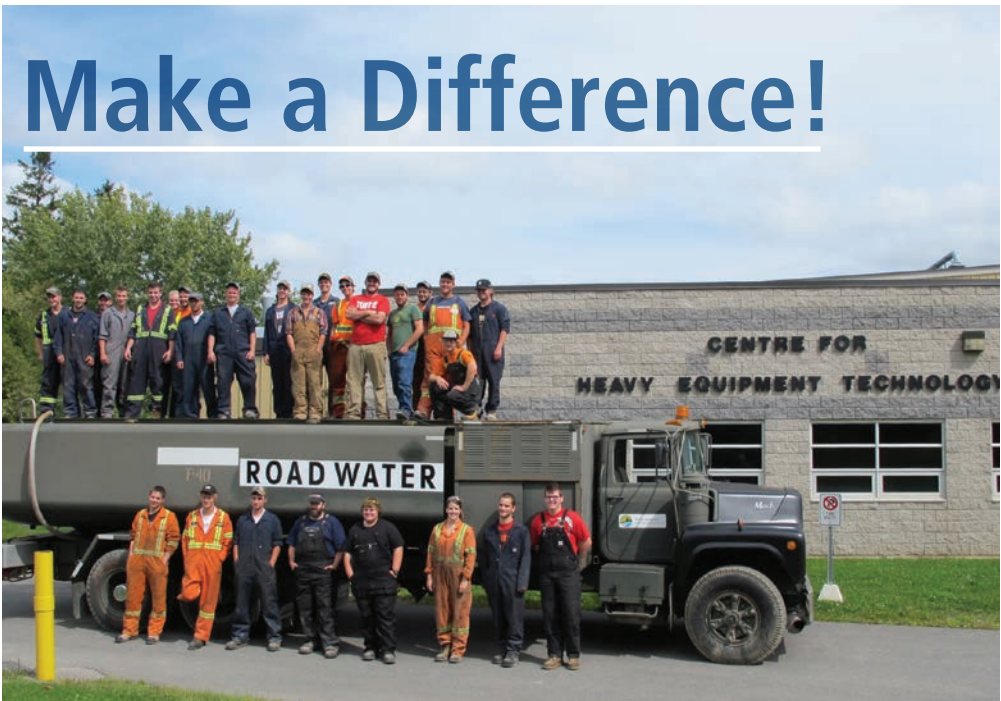
Heavy Equipment students with the recently donated water truck.