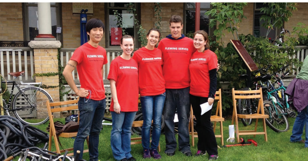
Fleming students participate in United Way Day of Caring

There are literally hundreds of research studies that discuss the benefits of philanthropy to the provider. So the next time you are wondering whether to say yes to that new committee or whether or not to train for that 10K, take a moment to think about not only how you will be helping others, but what unexpected benefits you might experience too. ✦