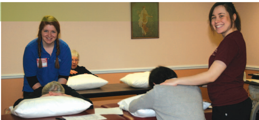
Guests at Caring for the Caregiver were treated to complimentary shoulder massages by Massage Therapy students.

On March 8th, Fleming College held a thank you breakfast for the hosts of our 2011/2012 manufacturing sector tours. In preparation for the upcoming construction of the Kawartha Trades and Technology Centre, over 40 area manufacturers and employers were consulted as our executive leaders toured their facilities and learned more about what they do, and what they need from our graduates and our programming. The delicious breakfast was prepared by the staff and students of the Culinary Management program. Thank you to all who attended. ❖