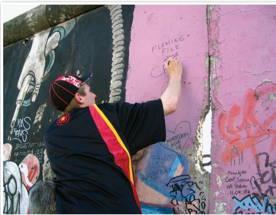
Students make their mark on the remnants of the Berlin Wall.

As a well-rounded, experiential course, F.I.L.E. helps contribute to the competitive edge students need to succeed in