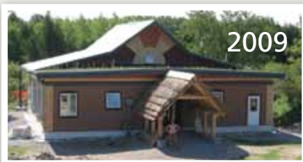
2009: Camp Kawartha Environmental Centre, Peterborough, Ontario