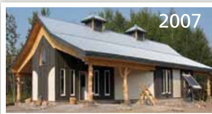
2007: RD Lawrence Place, Minden Museum & Cultural Centre, Minden, Ontario