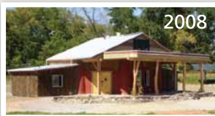
2008: Centre Hastings Community Arts Centre, Madoc, Ontario