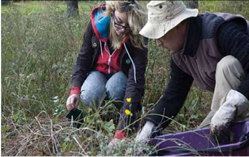
EcoStewards: Fleming Earthworker volunteers prep trails for Blue Lupin seed

"The enthusiasm our Fleming student volunteers bring to our environmental projects is amazing. These students want to learn and grow as naturalists; it is so wonderful to watch them give their time and energy to a cause they are committed to... both in their formal educations and in their day to day lives." – Robbie Preston, Director of Infrastructure, Altberg Wildlife Sanctuary Nature Reserve