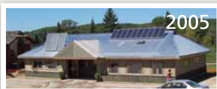
2005: 4C's Foodbank & Thriftstore, Haliburton, Ontario