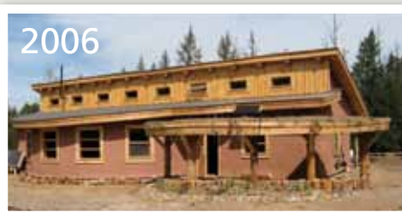
2006: Kinark Sustainable Living Centre, Carnarvon, Ontario